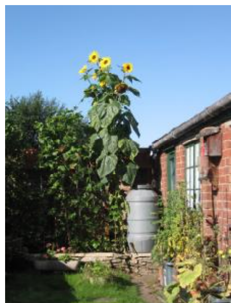
Yes they are over ten feet tall